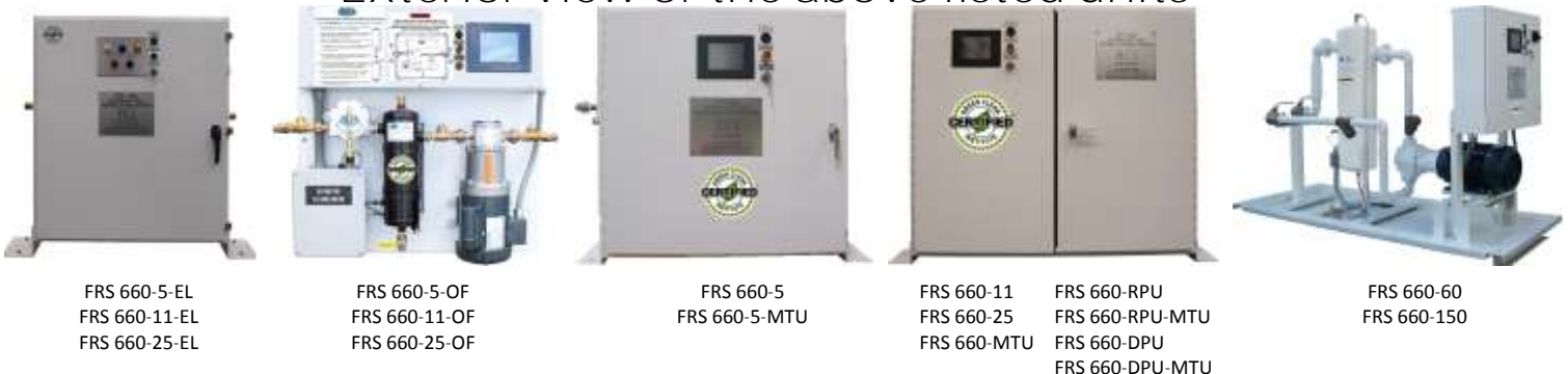
FRS 660-5-EL FRS 660-11-EL FRS 660-25-EL